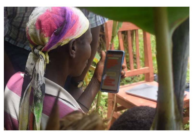
tested the new JEANNE app

It is not that difficult, but it does help to do it with the KA. It is nice to do it. It gives hope when the activities that we do are followed up.