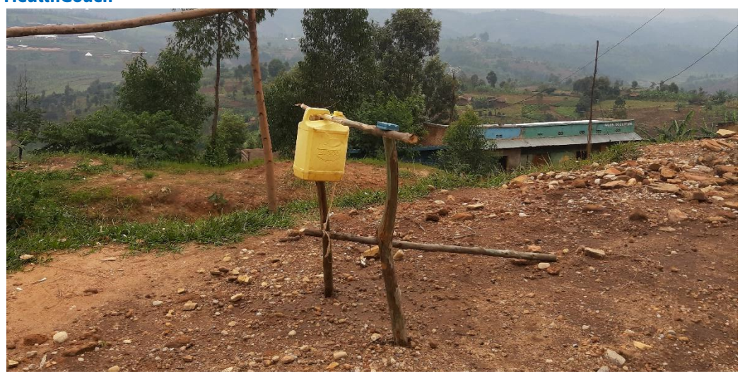
Picture outside the UMVA Centre of washing station. Saw some people using it when arriving.

Where do you get information from about Health?