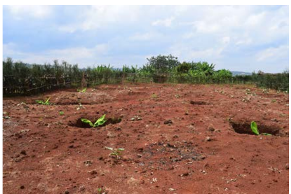
Gerards banana field with ACORN seedlings